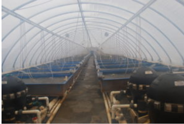
📷 Blue Ridge Aquaculture's hatchery.