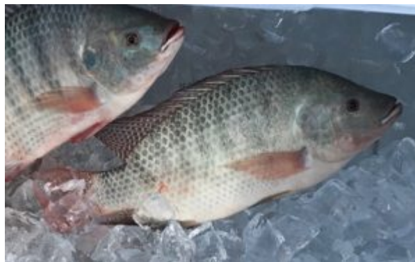
Fresh tilapia from EarthCare Aquaculture, a farm near Lake Okeechobee, Florida, that serves as the pilot for American Fresh Fillets.