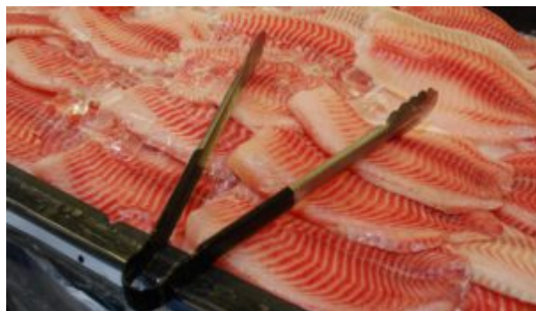
📷 Tilapia imported from China at an H-Mart, in Fairfax, Virginia.