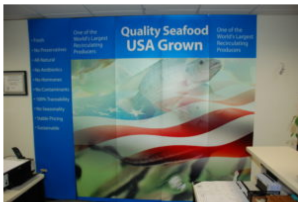
📷 The sign that greets you as you enter the offices of Blue Ridge Aquaculture. Land-based tilapia farmers believe their ability to slap a "Made in the USA" label on their products is a big tactical advantage.