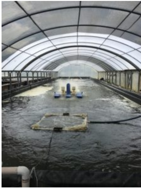
📷 EarthCare Aquaculture's greenhouse-approach to raising tilapia.

Another advantage that the company has is its location in Florida, where the warmer temperatures allow it to use outdoor greenhouses. There is no need for heating, like in the northern part of the US, or cooling, as is required by salmon RAS facilities.