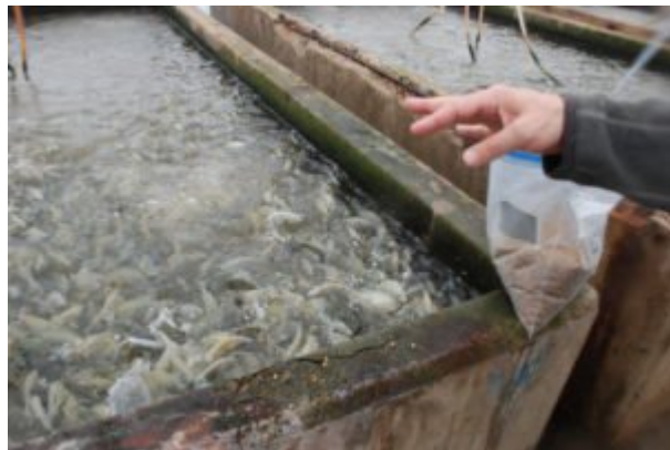
📷 Tilapia fingerlings make the water seemingly boil as they jump for feed at Blue Ridge Aquaculture.

Vinci identified no less than 82 finfish RAS companies of such size in the US.