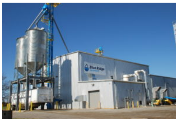
📷 Blue Ridge Aquafeeds a feed mill built by Blue Ridge Aquaculture at a cost of $5 million.

Martin also recounted how he caught a feed company stuffing its bags with 10% sand to inflate their weight and price. Because so many aquaculture farms use natural, outdoor ponds, they never would detect such a practice, he said. Not true at his facility, where the sand was damaging tanks.