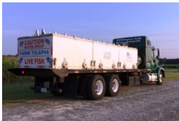
📷 A live haul truck shared by members of the Fresh Keepers cooperative, in North Carolina.

“Please, for goodness sake, ask them a couple questions, like, ‘Why are you blessing me with this wonderful technology? Why aren’t you doing it?’” he said. “Show me one of your operations that has operated with a profit for two years. Generally, that ends the conversation.”